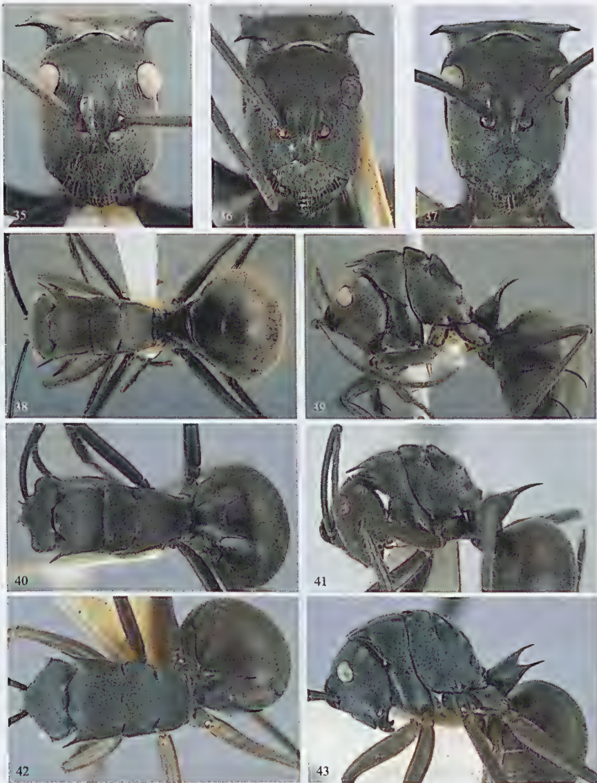
Figs 35-43. Polyrhachis spp. (35, 38-39) P. robusta sp. n. (holotype): (35) head in full face view; (38) dorsal view; (39) lateral view. (36, 40-41) P. sericeopubescens Donisthorpe (syntype): (36) head in full face view; (40) dorsal view; (41) lateral view. (37, 42-43) P. simpla Emery (syntype): (37) head in full face view; (42) dorsal view; (43) lateral view. Not to scale.

Frontal carinae sinuate with strongly raised margins; central area relatively narrow with weakly impressed frontal furrow. Sides of head in front of eyes weakly diverging anteriorly before rounding into mandibular bases; behind eyes, sides produced into